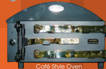
Café Style Oven